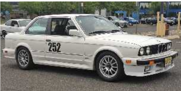
E30—the new classic