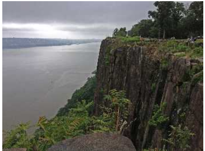
Overlook from the Palisades

I have to say, the whole Palisades area is one of those spots that I never knew existed being from Monmouth and now Ocean County. So with great excitement I also discovered the Henry Hudson Drive which follows the river for 9 miles, another hidden gem (to me at least) that looks like a great place to take the E21 for a spin on a Sunday. Perhaps this is a perfect place to gather a few club members and do a cars and coffee cruise. Meet at the park that overlooks the George Washington Bridge, head north on the HHD arriving at the Alpine Overlook for a picnic and hanging out. There is a little café at the overlook for everyone to get their caffeine fix.