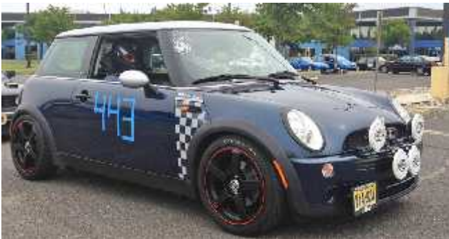
Mini ready to light 'em up