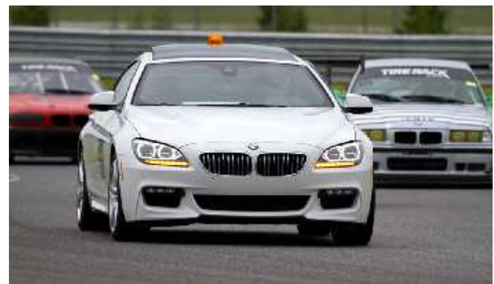
Fast Pace - BMW's Luxury Pace Car