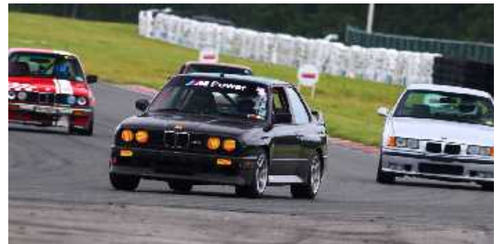
M Power Indeed