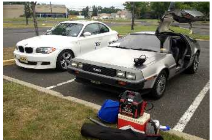
Good thing the course layout prevented speeds to reach 88mph.