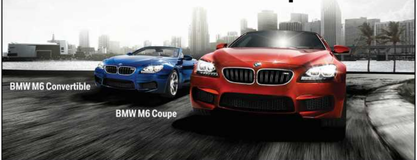
BMW M6 Convertible