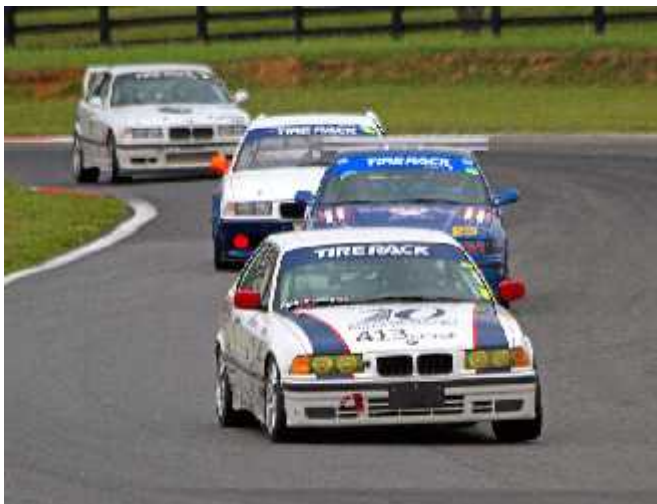
Spec E36 racer Rich Schickler leads a pack of cars through the carousel