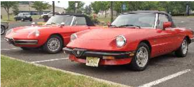
Along came two siblings, Alfas spyders