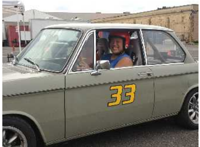
How can a 2002 owner not be happy?