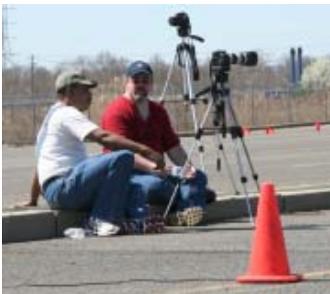
A hard day at the office...