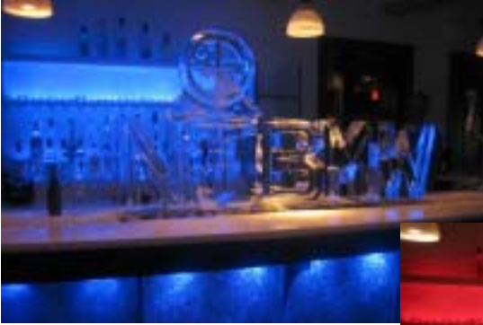
Ice Bar Cool