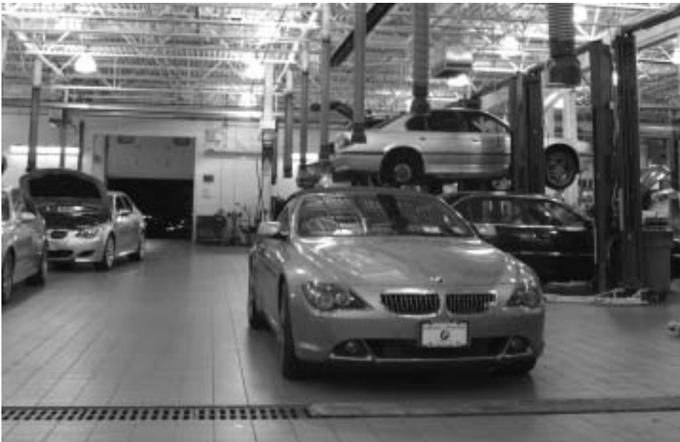
Open Road Service Bays