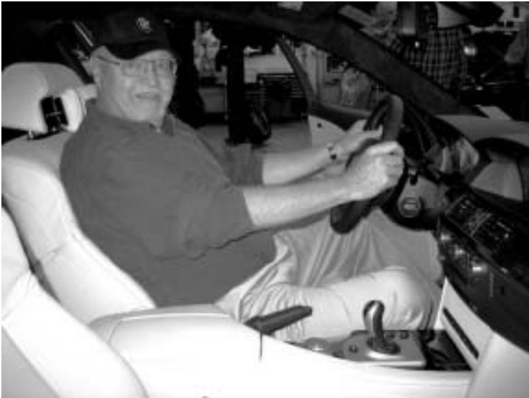
M5, Big Al's New Ride, Not