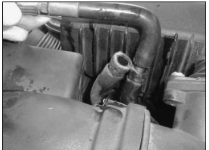
Photo 3: Flushing The Throttle Body Heater and Passenger Compartment Heater Core

Testing the valve is easy. Simply remove it and look inside the hose ports. If you see a bunch of glunk, the valve is probably stuck shut. I was able to disassemble, clean,