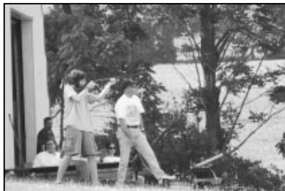
Skeet Shooting provided a fun activity for participants and spectators alike.