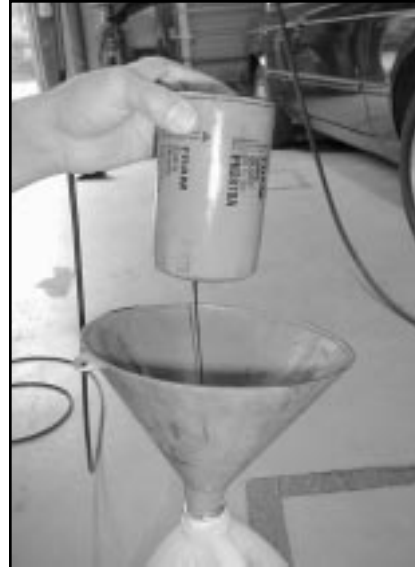
Photo 4: Steady stream of oil pouring out of the punched filter.

call before 8 PM, and if you leave a message, PLEASE INCLUDE A PHONE NUMBER WHERE I CAN REACH YOU ON WEEKDAYS DURING THE DAY. Also, please