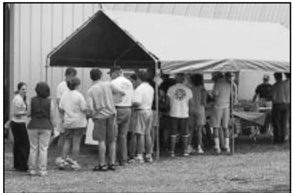
Picnic-goers stand in line for the delicious picnic food - hamburgers, hotdogs, BBQ chicken and veggie burgers.

More Picnic and Race photos throughout this issue!