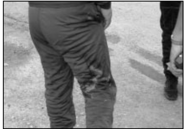
Tony Salloum demonstrates why club racers are required to wear fireproof suits! Tony's car caught fire during practice on Monday!