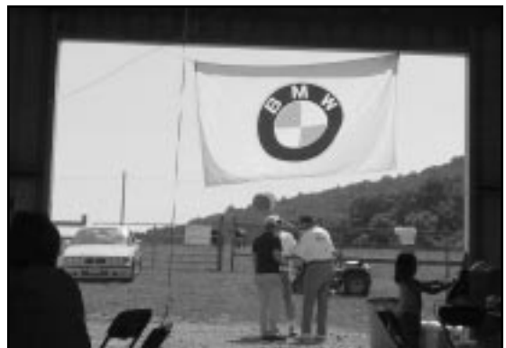
The Finch's barn provided a shady cool spot for picnickers to eat before heading out for the activities.