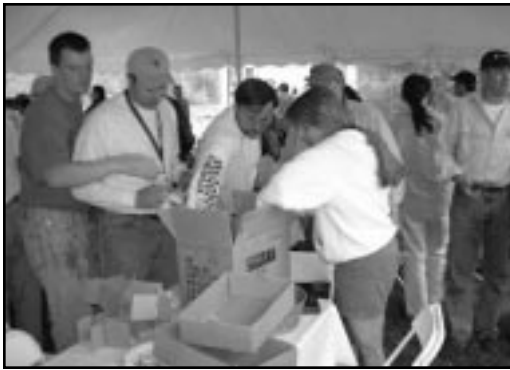
Put a crate of Paul Miller BMW mugs on a table and watch people knock each other over!