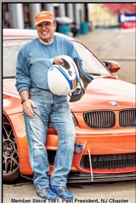
Member Since 1981 Past President, NJ Chapter